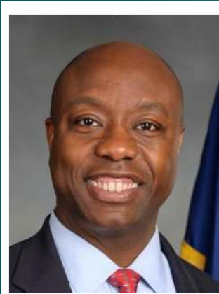
Senator Tim Scott