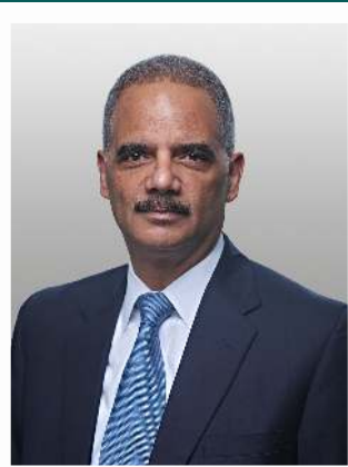
Attorney General Eric Holder